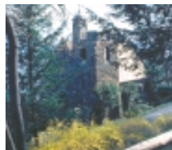
Garrett Memorial Chapel

When finished exploring this fascinating area, riders will find the Keuka Lake State Park filled with a variety of recreational opportunities to further enjoy this Finger Lakes favorite.